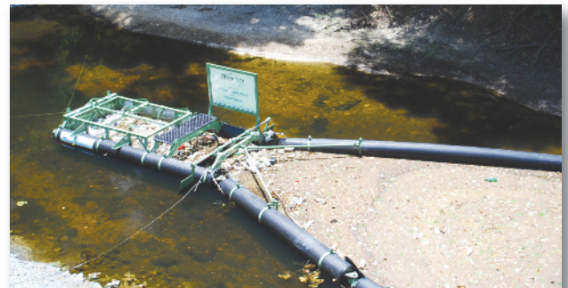
Bandalong Litter Traps, developed by Storm Water Systems, have been installed on the Satilla River near Waycross, the Anacostia River in Washington, D.C., and on the Arkansas River near the Clinton Presidential Library in Little Rock, Ark.

business venture. They partnered with an Australian company to